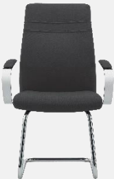
Visitor executive chair

Box gross weight 18,3 kg – Vol. box 0,30 m³